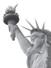
The Statue of Liberty is made of copper, which is orange-brown. But this copper is green because of its interactions with moist air. These interactions are chemical changes that form copper compounds. Over time, the compounds turn the statue green.

A fun way to see what happens during a chemical change is to bake a cake. A cake recipe combines different substances. Eggs, cake mix, oil, and water are mixed to form a batter. When the batter is baked, you end up with a substance that is very different from the original batter.