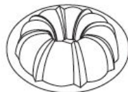
Cake mix batter becomes a cake.