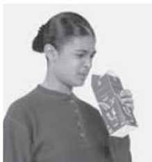
Soured milk smells bad because bacteria have formed smelly new substances in it.

6. Identify What property of milk told the girl that the milk had soured?