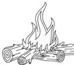
Wood burning in a fire

When wood burns, it becomes several different substances. Ash and smoke are just two of these new substances. The properties of the new substances are different from the original properties of the wood. Ash and smoke cannot burn. Unlike wood, they have the chemical property of nonflammability.