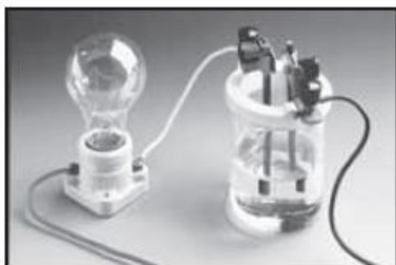
Pure water does not conduct an electric current.

In the pictures below, the pure water does not conduct an electric current. However, the solution of salt water conducts a current, so the bulb lights up.