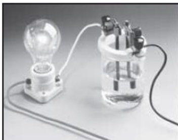
However, the solution of salt water does conduct an electric current, so the bulb lights up.